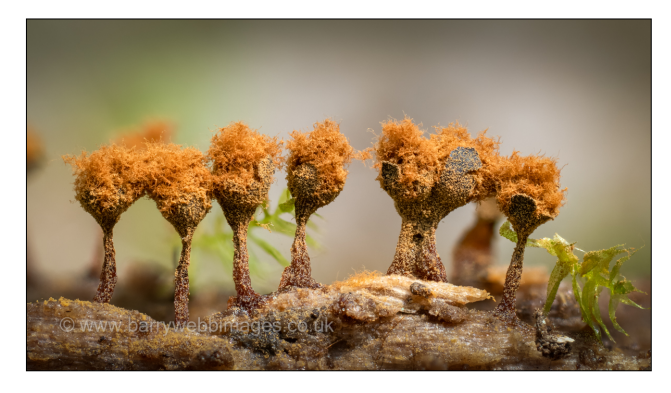
Right, Metatrichia floriformis and far right Reticularia lycoperdon. (BW)

Latin species name. Reticularia lycoperdon is for obvious reasons sometimes known as False Puffball but Barry informs me another name for it is Moon Poo! It forms large whitish eyeball-like splodges on wood - anything up to 10 cms across.