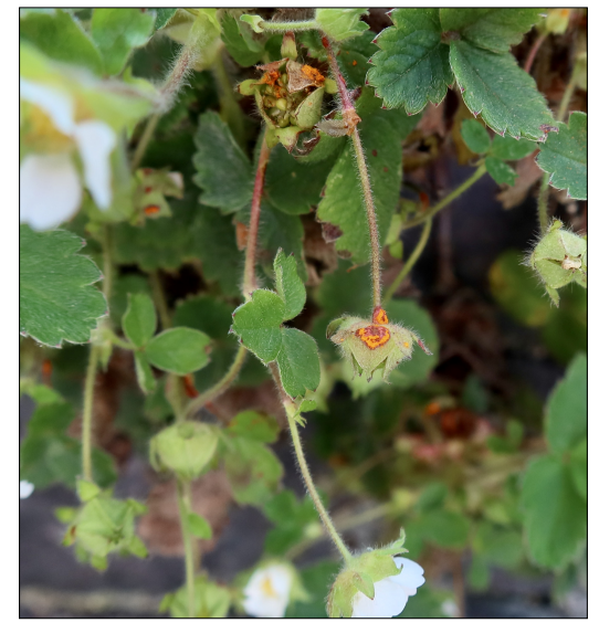
Above, the rust Phragmidium fragariae infecting Barren Strawberry growing out of the railway bridge here today. (Left BW and Right LS)