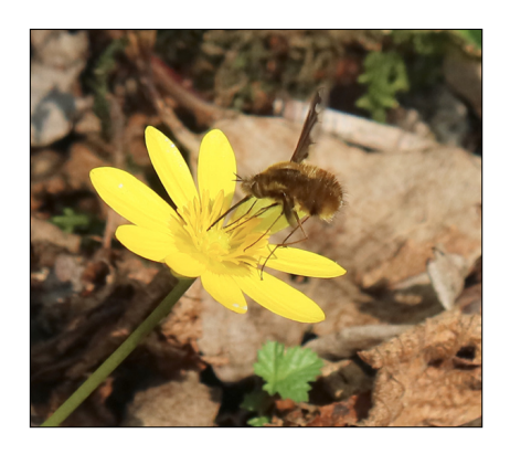
Left, Bee Fly on Celandine (LS); Centre, Dog Violet (LS); Right, Orange Underwing moth (LS) and underneath, the fern Aspenium ruta-muraria on the railway bridge (CS) Group photo (LS)