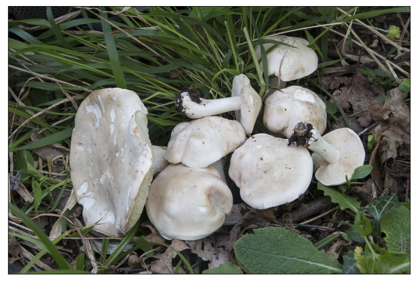
Above left, Calocybe gambosa, and right, Verpa conica – both found in the tram track path today.